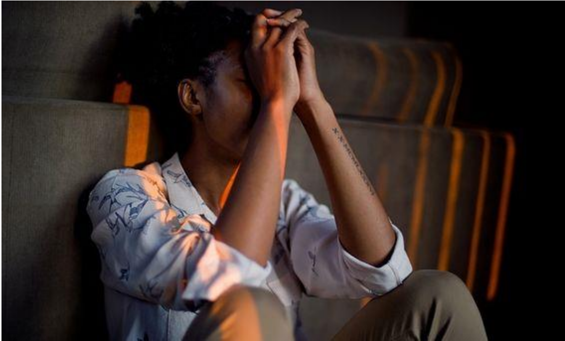
Stress is the worst ally when it comes to decision-making. Image: Pixabay

This means that, for example, in a conflict setting and when confronted with extreme deprivation and fear, humans will act with a view to meet immediate needs (such as survival) and be less focused on long-term goals. Other studies showed that stress is negatively correlated with utilitarian responses in moral decisions and that it is correlated with more egocentric moral decisions . Interestingly, stress is also shown to lead to more prosocial behavior and trust (as part of a protective mechanism, making it easier to cooperate with and rely on others) but also to less generosity. These examples are not exhaustive but they demonstrate the critical importance of circumstances in shaping human morality. From a governance perspective, it is important to ensure the conditions for the most altruistic and moral traits of our nature to thrive but this cannot be taken for granted. It is only with institutions and policies that foster safety, peace and inclusion that the minimum requirements for human morality can be guaranteed.