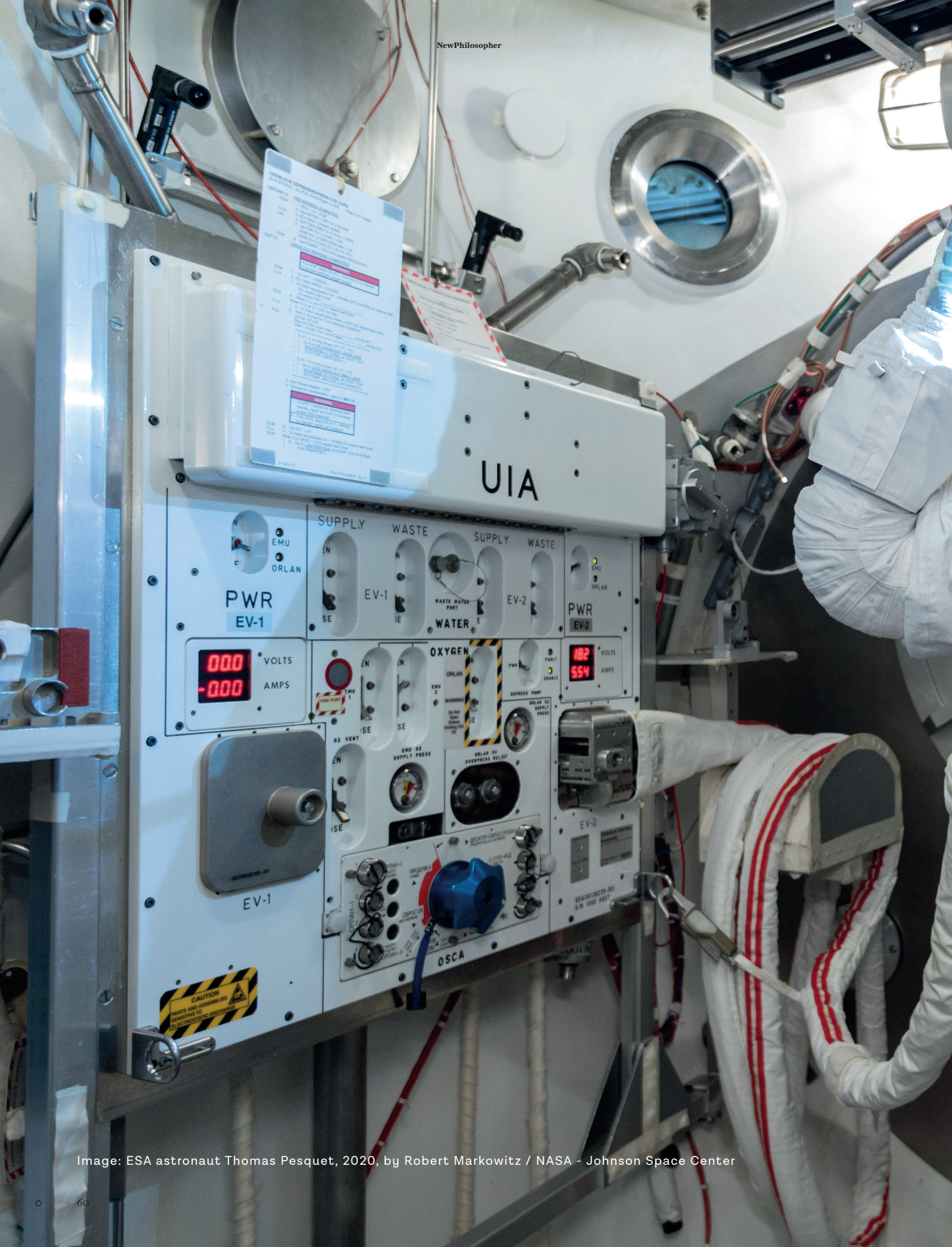
Image: ESA astronaut Thomas Pesquet, 2020