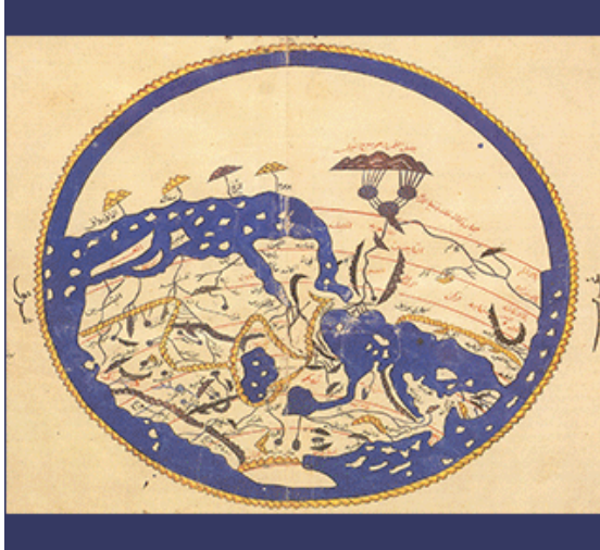
Wisdom from the East: The House of Wisdom – the royal library in Abbasid Baghdad (top); the world map by Al-Idrisi, looking southward

OXFORD: Recent years have seen much talk of the dangers of Islam in the West and its perceived incompatibility with Western societies. According to statistics, estimated on the basis of country of origin and of first- and second-generation migrants, Muslims represent the largest “non-indigenous” immigrant group in Europe. The largest groups are in France, with approximately 5 million; Germany, between 3.8 and 4.3 million; and the UK, 1.6 million, followed by the Netherlands and Italy, 1.1 million each, as well as Bulgaria and Spain.