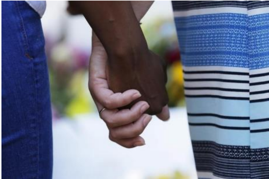
Discrimination still exists, but our brains don't doom us to be biased.

In the US and elsewhere, many have claimed that race-based discrimination has decreased because of egalitarian social norms. This assumption, however, goes contrary to the abundance of evidence showing that prejudices continue.